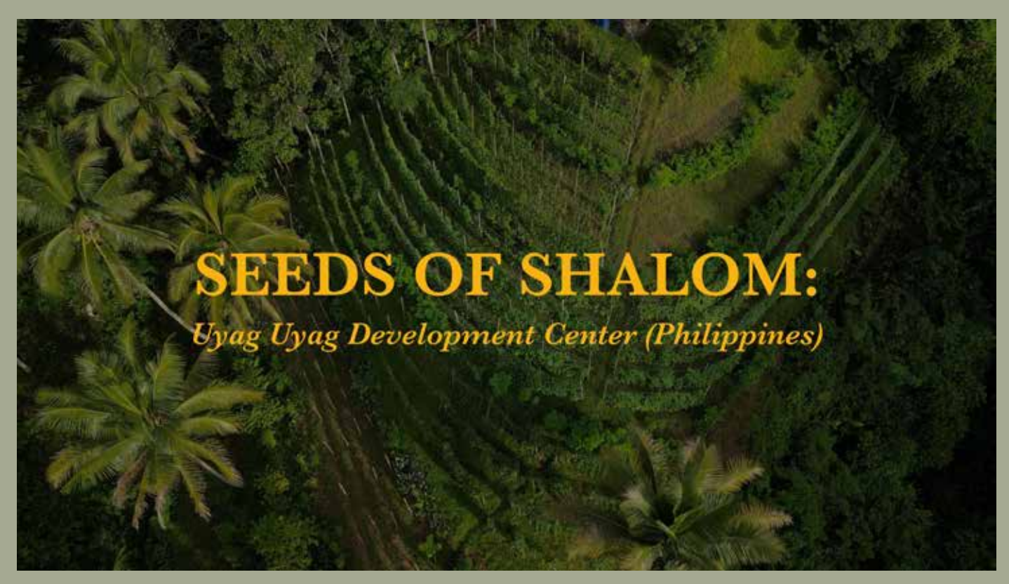
Click to play (requires internet connection)

What does it mean to have a relationship with the people in your community and the place where you live?