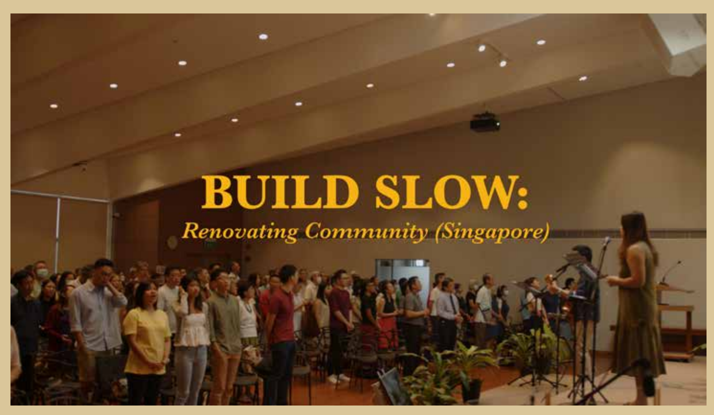
Click to play (requires internet connection)

What is the general perception of caring for God's creation in your community? Explain why you think it is so.