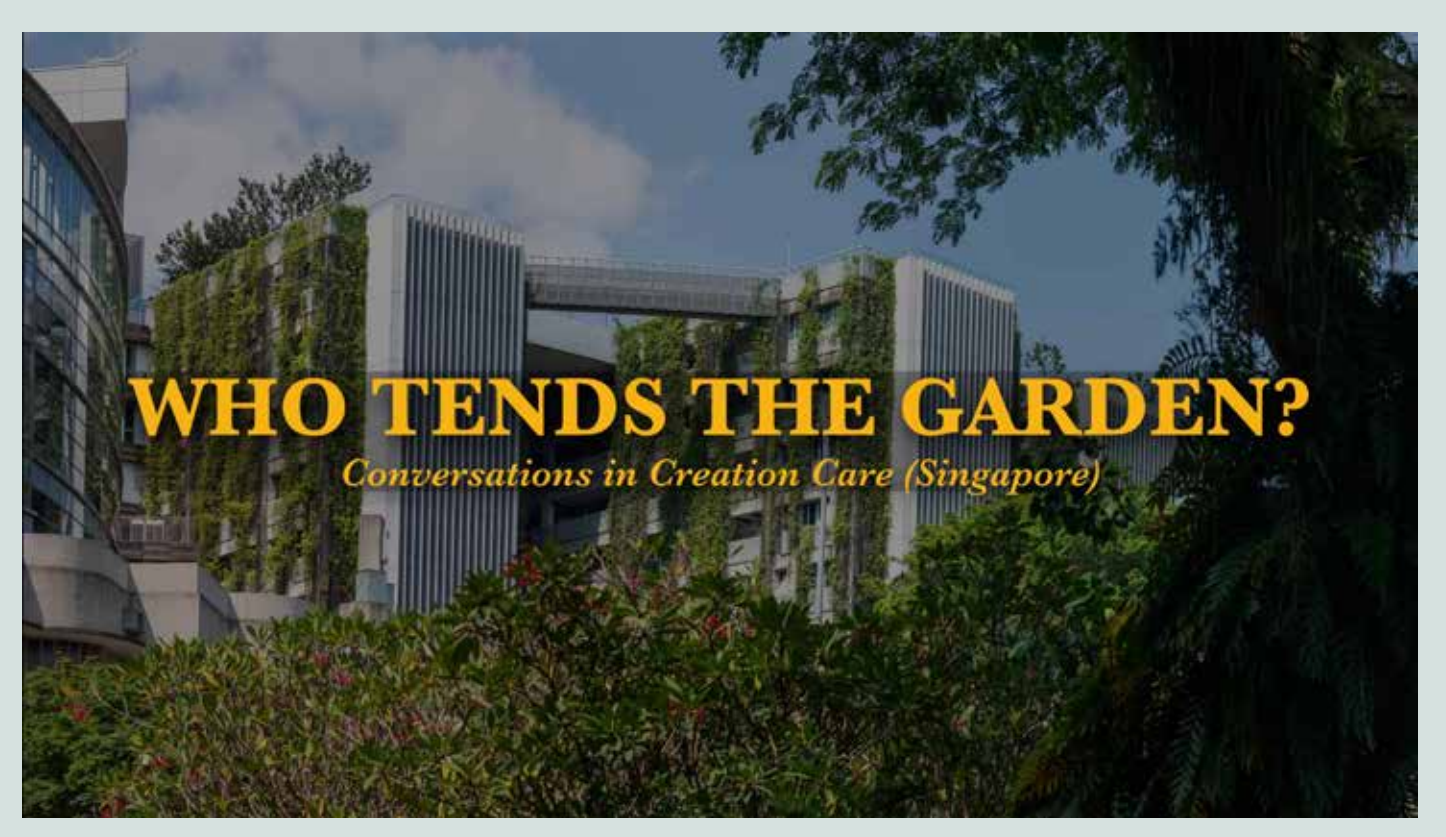
Click to play (requires internet connection)

What is the significance of the link between Adam (humanity) and adama (earth)?